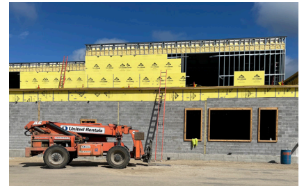
Above: Masonry nearly completed throughout. Widow blocking installed.