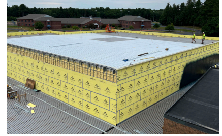
Above: Gym wall spray foam insulation and sheathing being completed. Roof work ongoing.

PHASE 7: DELIVERY OF NEW GYM, FINAL PHASE OF EXISTING CLASSROOM WING