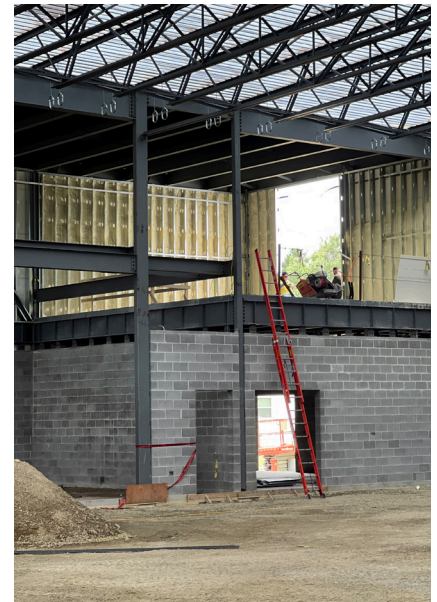
Above: Mechanical mezzanine slab installation completed. Trades work continues.